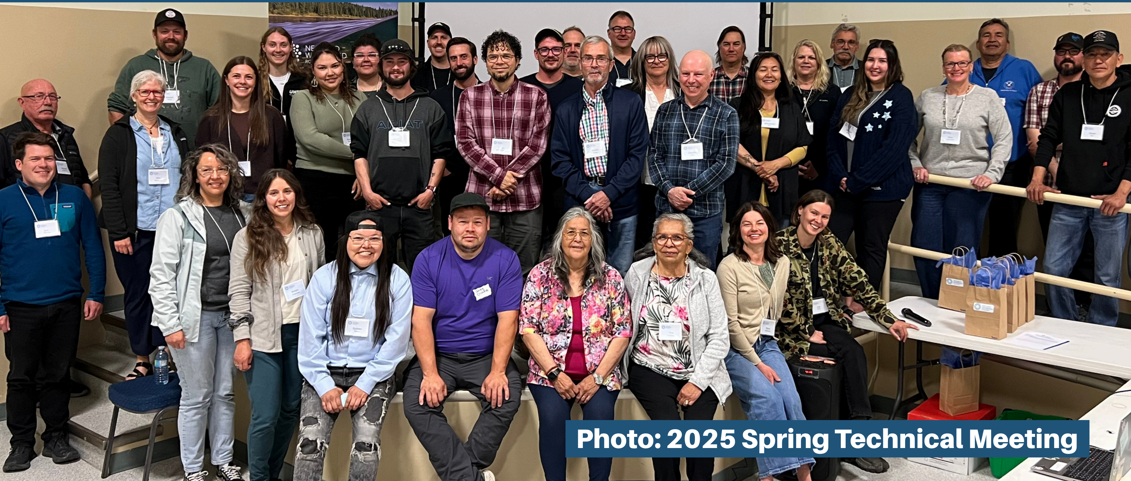
Photo: 2025 Spring Technical Meeting